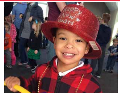
Northeast Library 2200 Central Ave. NE, Minneapolis | 612.543.6775 | hclib.org